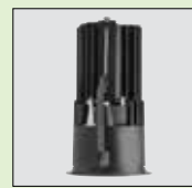
GOTHAM® INCITO™ 2"