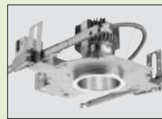
GOTHAM® EVO® 4" ARCHITAINMENT