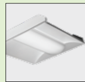
LITHONIA LIGHTING® VTL