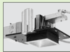
GOTHAM® EVO® 4" WARM DIMMING